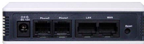
ATA171plus front and rear view Color : Gray