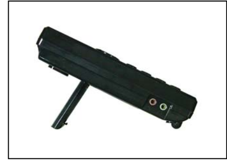
Support 3.5mm plug-in Ear Phone and Microphone.