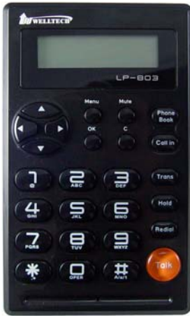
Black Panel, Dimension 16(H)x9.7(W)x3.5(T) CM